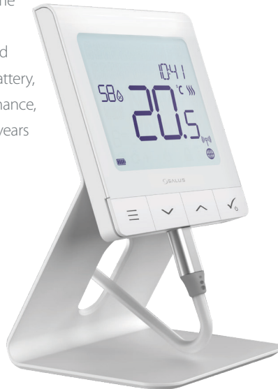
iT700 Thermostat shown here with optional USB docking station (sold separately)

The SALUS iT700 Smartphone controlled thermostat offers versatile installation options, allowing it to be either wall-mounted or placed on a desktop using a convenient USB docking station (sold separately). This flexibility ensures that the thermostat can seamlessly fit into any home decor or layout, providing both aesthetic appeal and practical functionality. Powered by a 750mAh Lithium-Ion rechargeable battery, the iT700 guarantees long-lasting performance, with a single charge providing up to two years of reliable use. This extended battery life minimizes maintenance and ensures continuous operation, making the SALUS iT700 an efficient and user-friendly choice for modern home climate control.