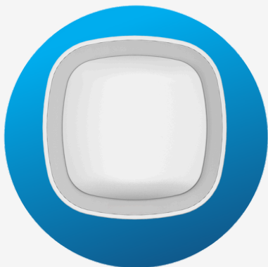
Smart Motion Sensor