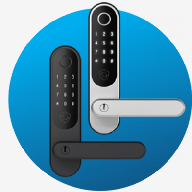
Smart Door Lock